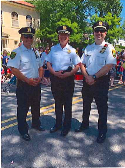
The Administrative staff of the Glen Ridge Police