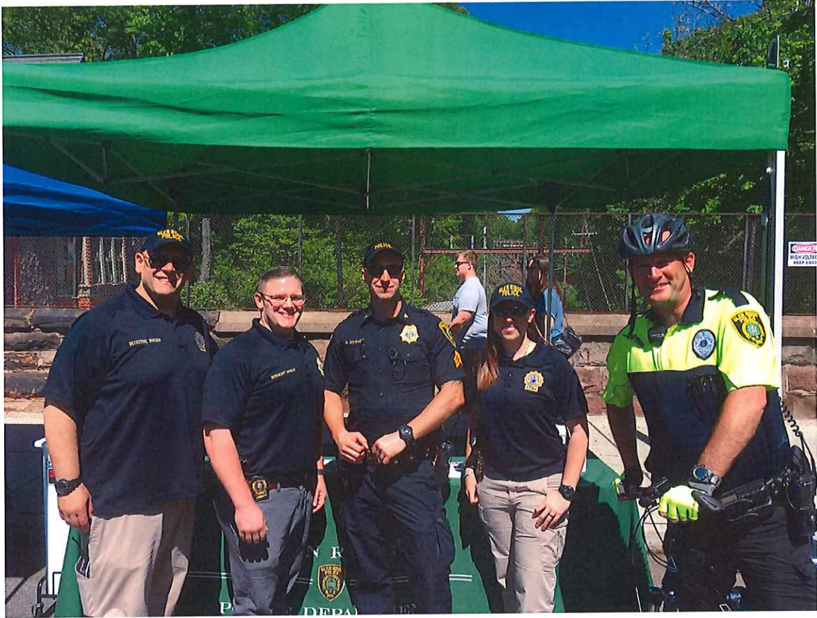
The Glen Ridge Detective Bureau and Community Policing Staff participated in this years Arts Festival.