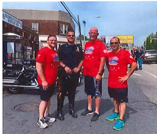
2019 Special Olympics Torch Run