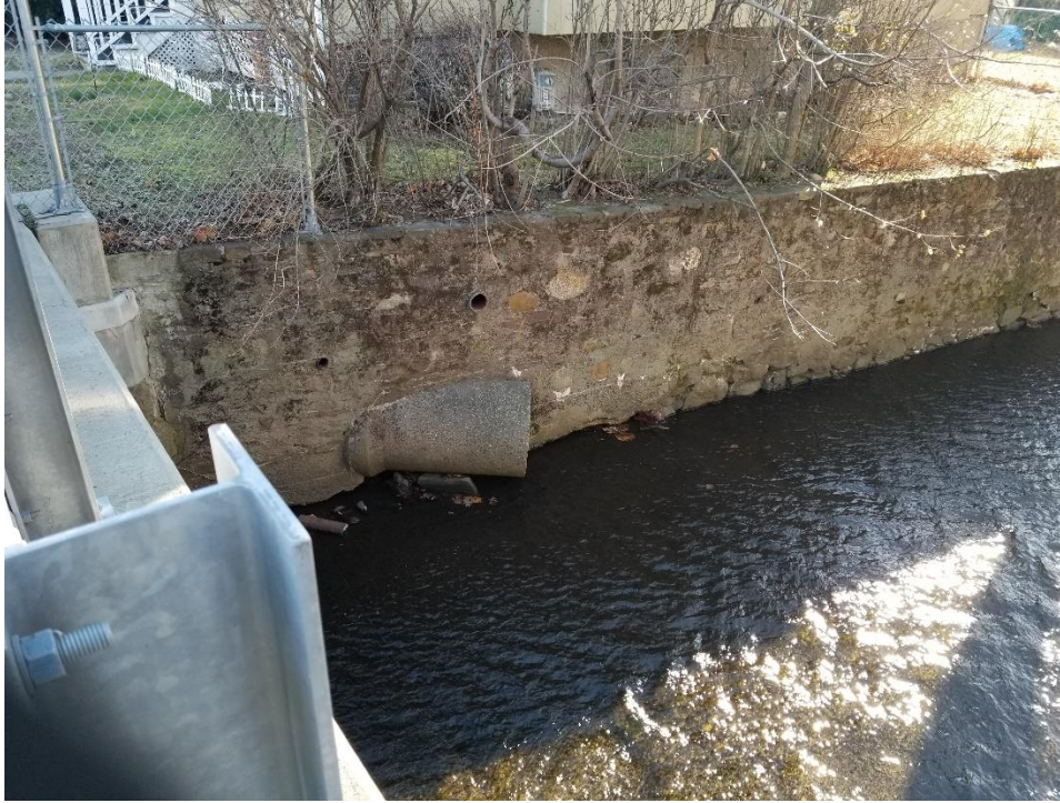
Six GR Clark Street Bridge South 40.796556, -74.201418