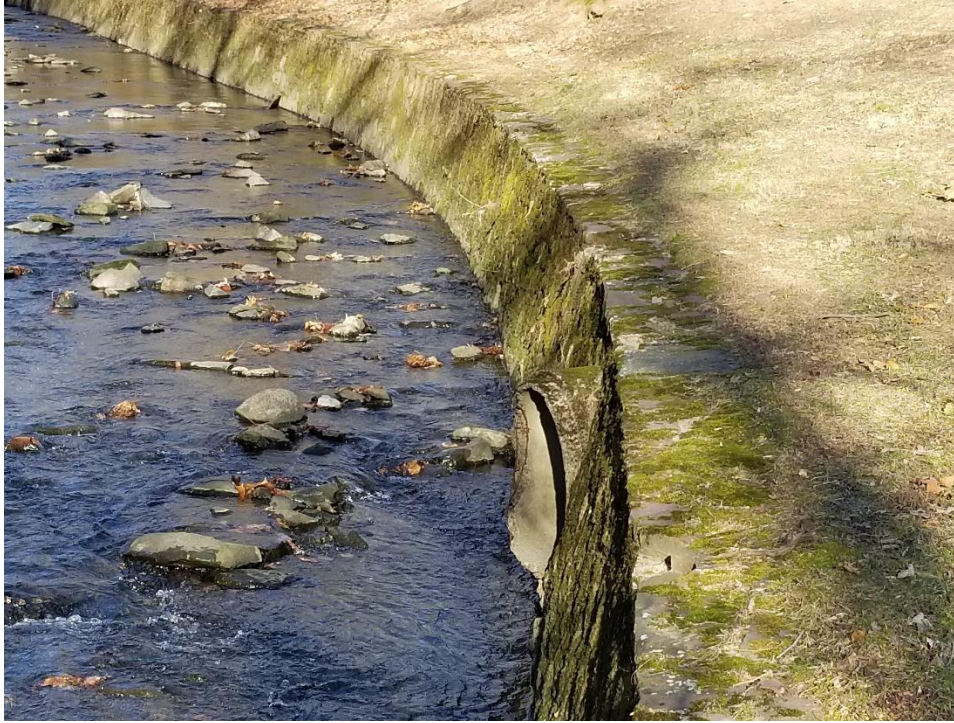
Four GR Hillside – Toney's Brook Avenue Bridge South 40.798889, -74.202177