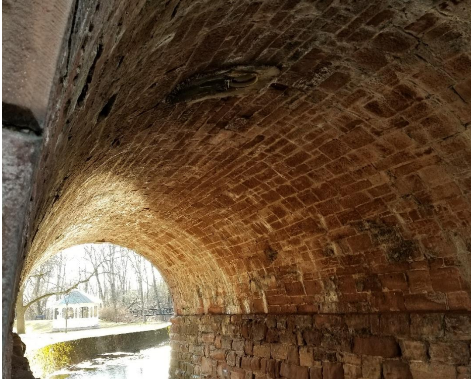
Two EC Ridgewood Avenue Bridge South – Toney's Brook 40.800445, -74.204096