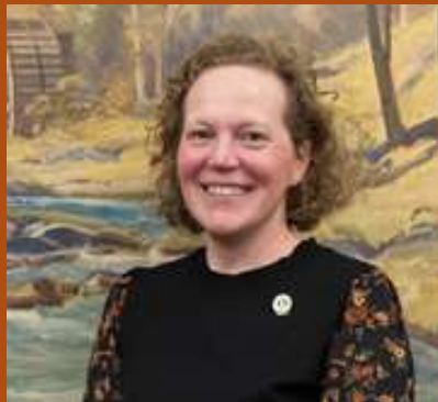
Mayor Debbie Mans