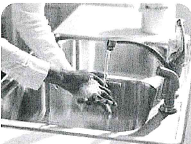
Wash Hands with Soap and Water