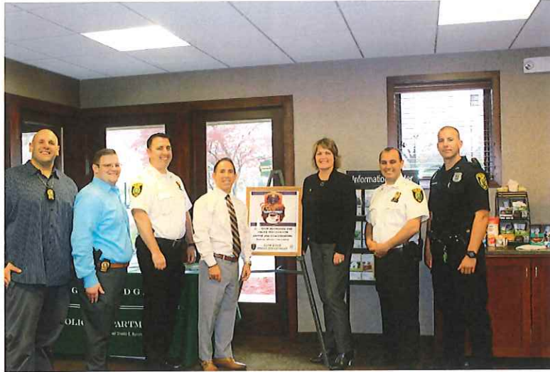
The Glen Ridge Police Department hosted Coffee with a Cop at the Boiling Spring Savings Bank.