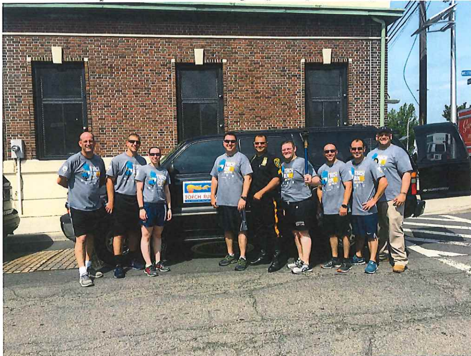
2018 Special Olympics Torch Run